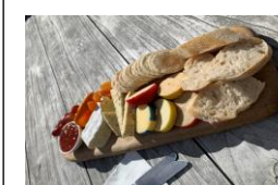
Maleny Cheese Factory

We have had some wonderful outings in the past few weeks. A visit to the Maleny Cheese Factory was very successful and thoroughly enjoyed by all who attended. The weather has been a little kinder with sunny skies even if a little chilly. Please take a little time to have a look at our facebook page – The Metro Community Hub. You will see snaps from most of our outings and activities and also catch up on what is happening at our Hub. Here are a few photos for those who don't have facebook for you to enjoy.