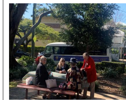
New Farm Park and City Cat